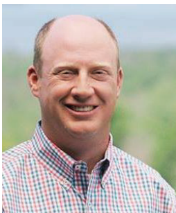
Lt. Governor Will Ainsworth