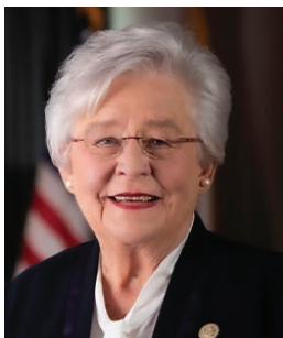
Governor Kay Ivey