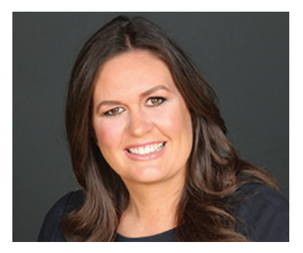
Governor Sarah Huckabee Sanders