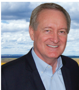
U.S. Senate Mike Crapo

Endorsements are current as of mailing date.