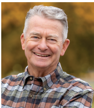
Governor Brad Little