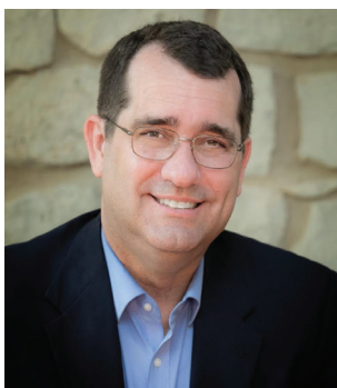
Governor Derek Schmidt