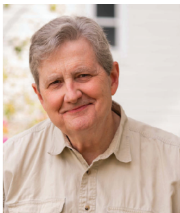
U.S. Senate John Kennedy