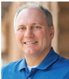
Steve Scalise LA-01