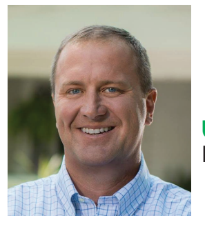
U.S. Senate Eric Schmitt