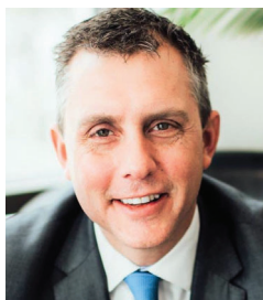
U.S. House ND-At Large Kelly Armstrong