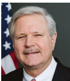
U.S. Senate John Hoeven*

Endorsements are current as of mailing date.