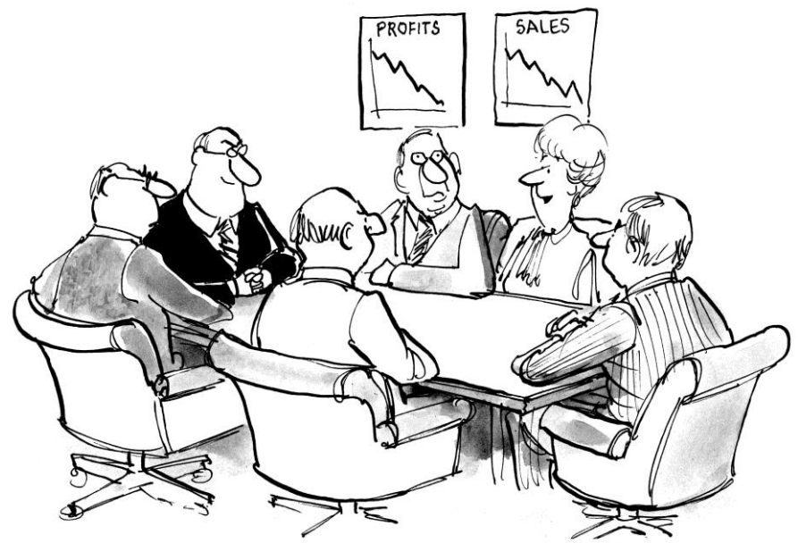
"What if we don't change at all ... and something magical just happens?"