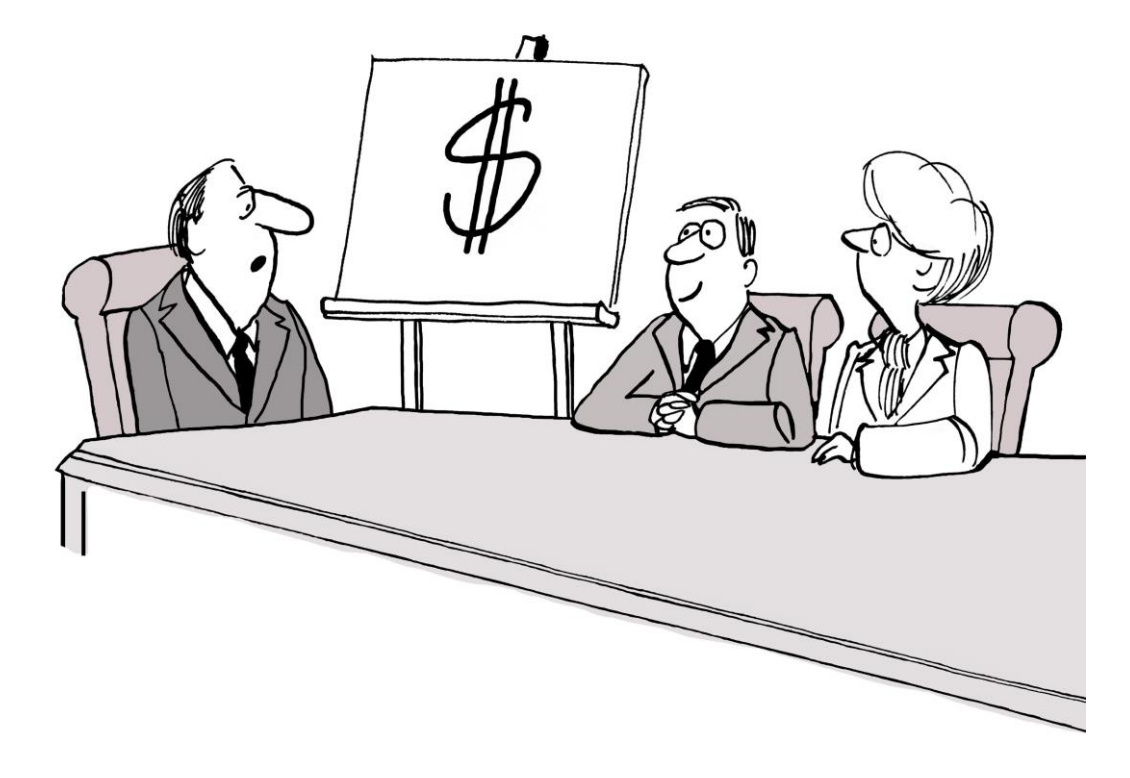
"Great plan. Could we get some more details?"