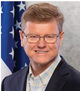
Mark Amodei NV-02