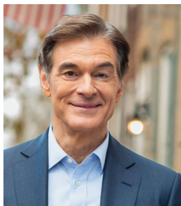
Dr. Mehmet Oz