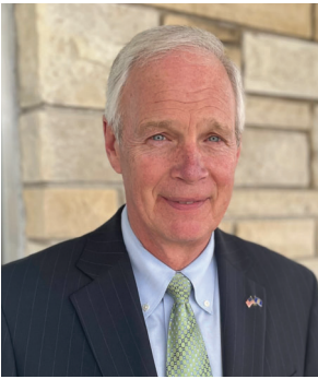
U.S. Senate Ron Johnson*

Endorsements are current as of mailing date.